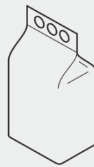
Bag With Finger Grip