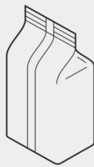
Flat Bottom Bag