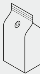
Bag With Valve