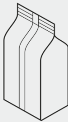
Corner Creased Bag